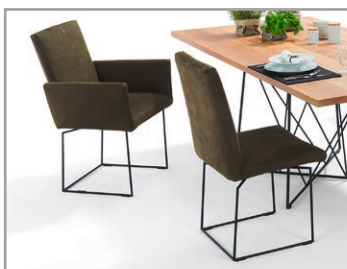
Casual chair with functional back, optionally with or without armrest