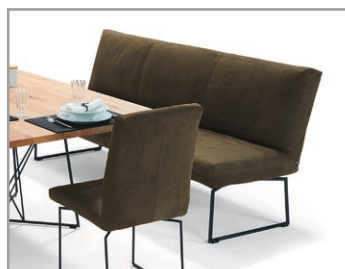
Comfortable bench, optionally with or without armrest