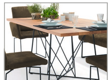
Matching solid wood dining tables