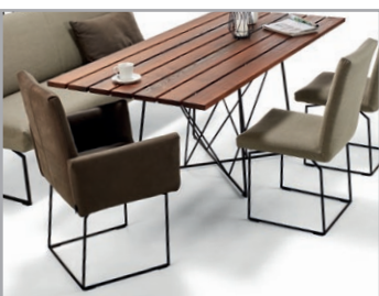
Casual chair with functional back, optionally with or without amrest