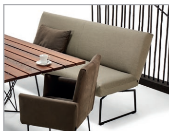
Comfortable bench, without amrest