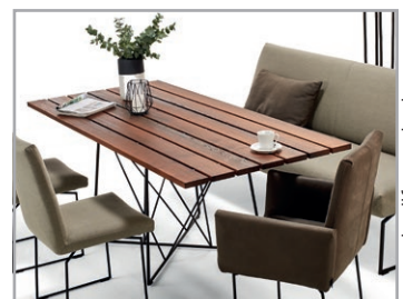
Matching, planked solid wood dining table